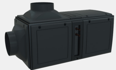
Water-cooled systems available.

Wine Guardian Pro units come installed with service ports, appropriate pressure switches, and a refrigerant sight glass to allow for faster and more efficient maintenance .